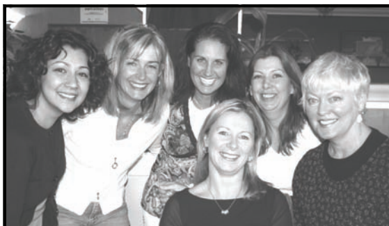
Excellence Seminars International Team 2006-2007